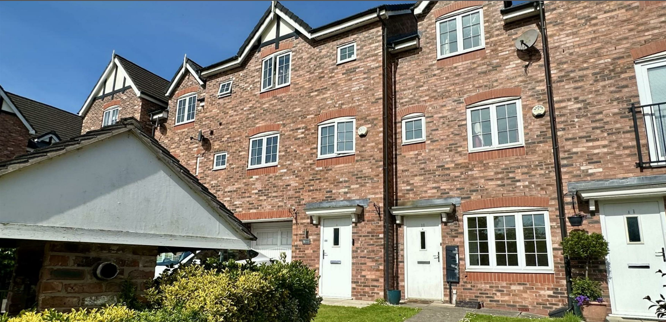
10 Welldale Mews Sale, M33 2NS Guide Price £410,000